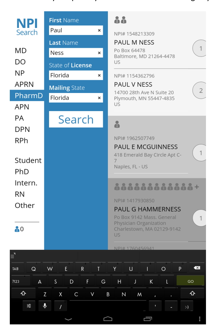
I just joined the NPI registry yesterday! Why I am I not found on the app?

Your primary business location according to the NPI registry is based in Maryland. You have recently started practicing in Maryland, however currently this is not your primary business location. We recommend you update your details with the NPI registry.